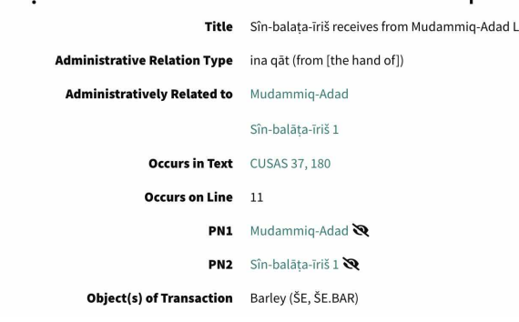
Figure 3: A record exemplifying the textual representation of a relationship factoid (second line of the search results in Fig. 2).