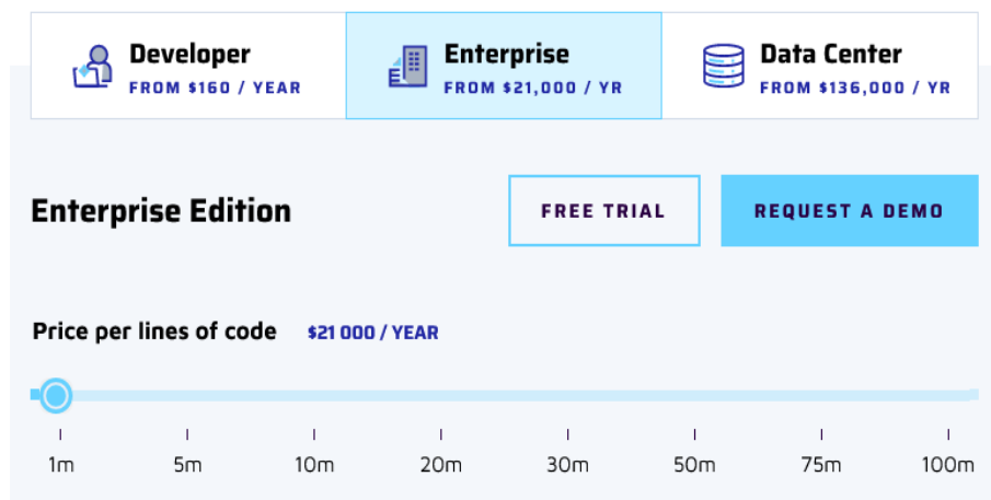
Figure 3: Different tariffs provided by Sonar

Also, most professional analyzers and sanitizers are not free, which in turn imposes certain restrictions on the development of projects with a small budget. For example, let's consider one of the most popular code analyzers sonar, this tool has different tariff plans, but most companies choose the Enterprise plan [26].