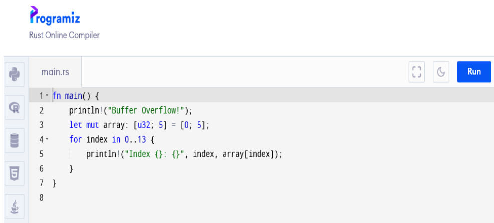
Figure 6: Rust code sample for buffer overflow

Using the Rust programming language (Fig. 6) makes it impossible to prevent buffer overflows and access to other data, as demonstrated in Fig. 4. The results are shown in Fig. 7.