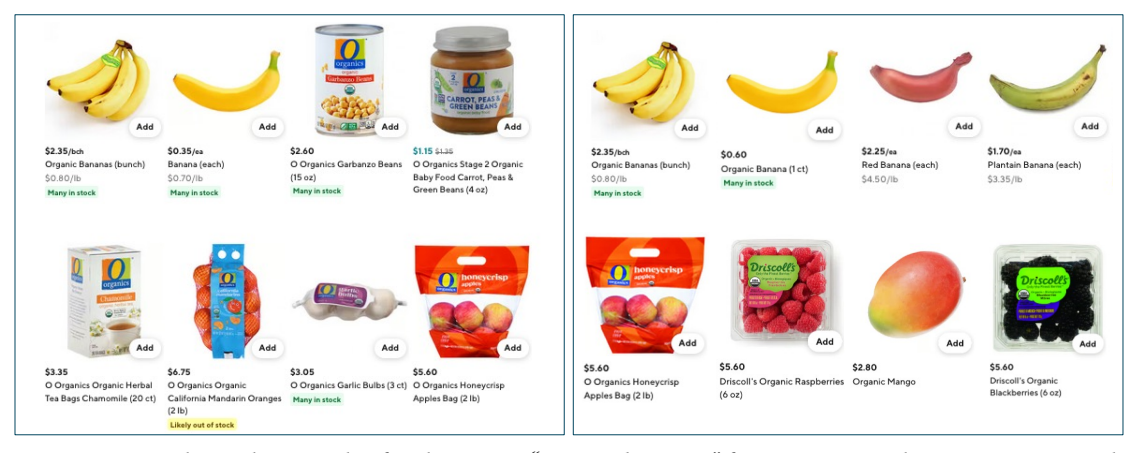
Figure 2: Search result examples for the query "organic bananas" for a commercial e-commerce search engine in the grocery domain with (right) and without (left) query understanding.

and 99% with label c_k would be considered in the same way a query q_{i'} that has 99% interaction with label c_j and 1% interaction with label c_k , producing a skewed prediction where the minority label c_k could take precedence on the more popular usage of the query. This is particularly important when the predicted query labels are used as input features to optimize (or re-rank) a search result returning matching products from a catalog. Considering the first example in Figure 1, a search engine could return a majority of products from the Craft Supplies minority class rather than boosting results from the Stencils category, compromising the actual result relevance and potentially missing product conversion opportunities.