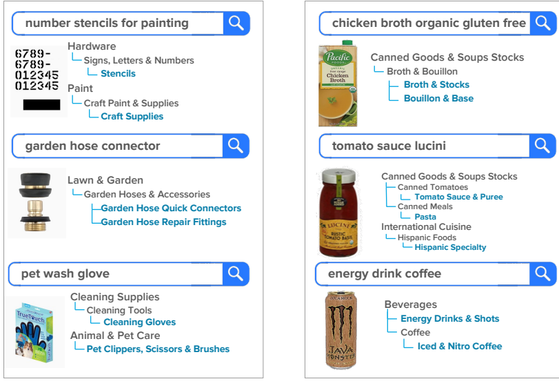
(a) Home improvement domain