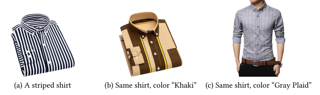
Figure 1: Different variants of a product on Amazon

If a user is looking for a "men's dress shirt with thin vertical stripes", they might expect that this product is a relevant match based solely on the textual metadata. However, when looking at the product images, they would quickly notice that the stripe pattern on the shirt is not "thin" but rather "thick" stripes. Not only that, but many of the different color options in fact have a completely different design and thickness of stripes, while some color options have a checkered pattern instead of stripes (Figure 1).