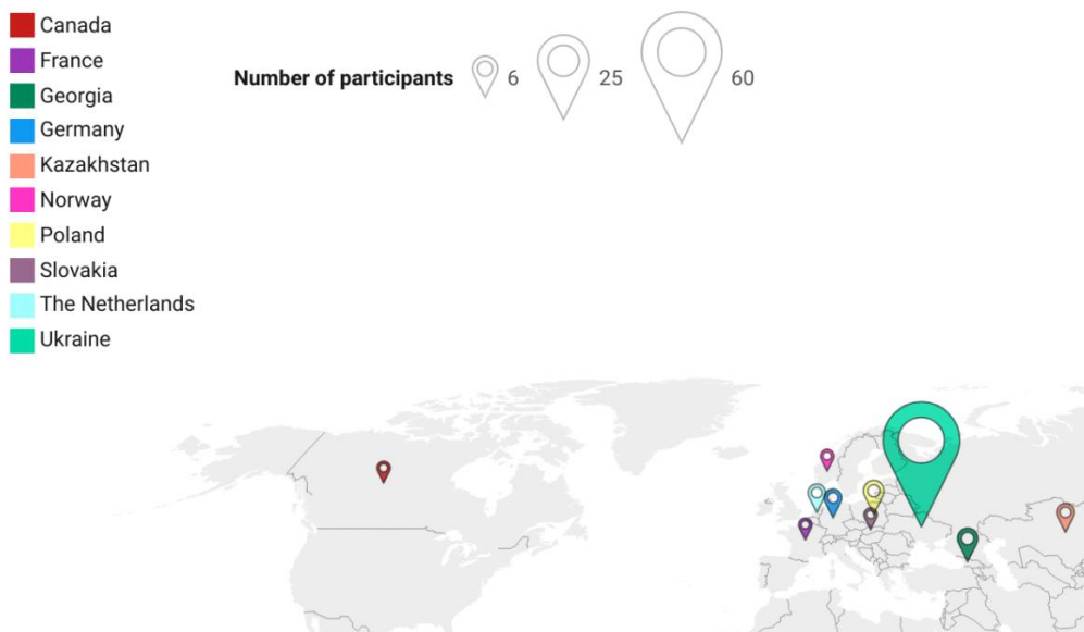
Figure 2: Geographic distribution of SCIA-2024 workshop participants

To illustrate the institutional distribution of SCIA-2024 participants, a bar chart will show the number of participants by affiliation, underscoring the workshop's expanded reach not only internationally but also across various Ukrainian regions.