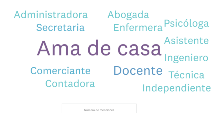
Figure 4: Word cloud about the mother's occupation.

In terms of the mothers' occupations, as depicted in figure 4, it was observed that 25.2% identified as housewives. Following this, the most prevalent occupations included teacher (15.25%), merchant (10.8%), and secretary (8.4%). Notably, only a small percentage (3.6%) were employed as engineers or technicians. These findings shed light on the diversity of occupations held by mothers, with a notable representation of traditional roles such as housewives alongside other professions like teaching and merchant.