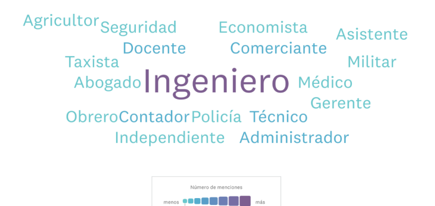
Figure 2: Word cloud about the father's occupation.

Analysis of the fathers' occupations revealed that 22% of them were employed as engineers, encompassing various specialties such as civil, industrial, systems, electronic, and chemical, among others. Interestingly, there was no discernible pattern in terms of the distribution of engineering specialties. Following engineering, the next most common occupations included technical roles (8.4%), accountants (8%), teachers (7.2%), and merchants (7.2%). To facilitate a clearer visualization of these occupations, a word cloud was generated, as depicted in figure 2. This visual representation offers insight into the diversity of occupations held by the fathers of the women in the study.