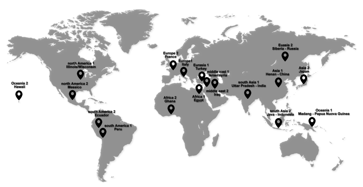
Figure 2: Distribution of the sampling zones. There are two sampling zone per World region: North America (US, Mexico), Oceania (Hawaii, Madang - Papua New Guinea), South America (Ecuador, Peru), Europe (France, Italy), Africa (Egypt, Ghana), Middle East (Levant, Iraq), Eurasia (Turkey, Siberia), South Asia (Uttar Pradesh - India, Java - Indonesia), East Asia (Henan - China, Japan)

tative and structured or semi-structured data about the evolution of societies, defined as political units (polities) from 35 sampling points across the globe in a time window from roughly 10000 BC to 1900 CE, sampled with a time-step of 100 years. A sampling frequency of 100 years is too much coarse-grained, not suitable to track the internal phases of the secular cycle, thus we resampled the data with a sampling frequency to 10 years, manually integrating data and descriptions from Seshat and from Wikipedia. To do so, we followed these general guidelines: