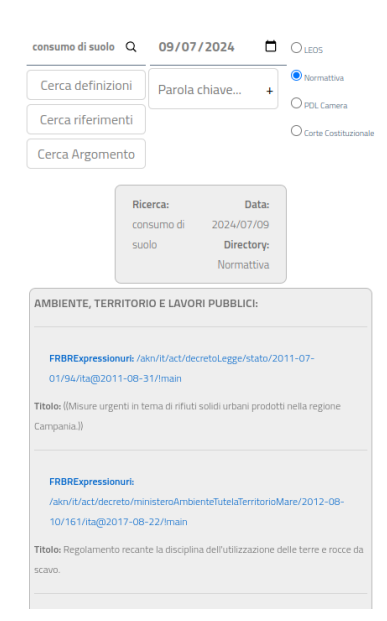
Figure 2: The first results of our search by topic system. Using the query "land consumption" in Italian on the Normattiva dataset, the system returns the appropriate Camera commission (environment, territory and public works) and the first two results are relevant (one is about waste management, the other about rocks and earth from excavation projects).

While this is just a preliminary assessment of the classification performance of our unsupervised model, it is possible to derive that the label applied to the documents is correct in at least 39% of the cases, meaning that the approach is indeed able to link a document with its more relevant anchor with a good level of approximation.