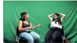
(a) Unmasked scenario, Same sight conditions