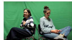
(b) Masked scenario, Different sight conditions