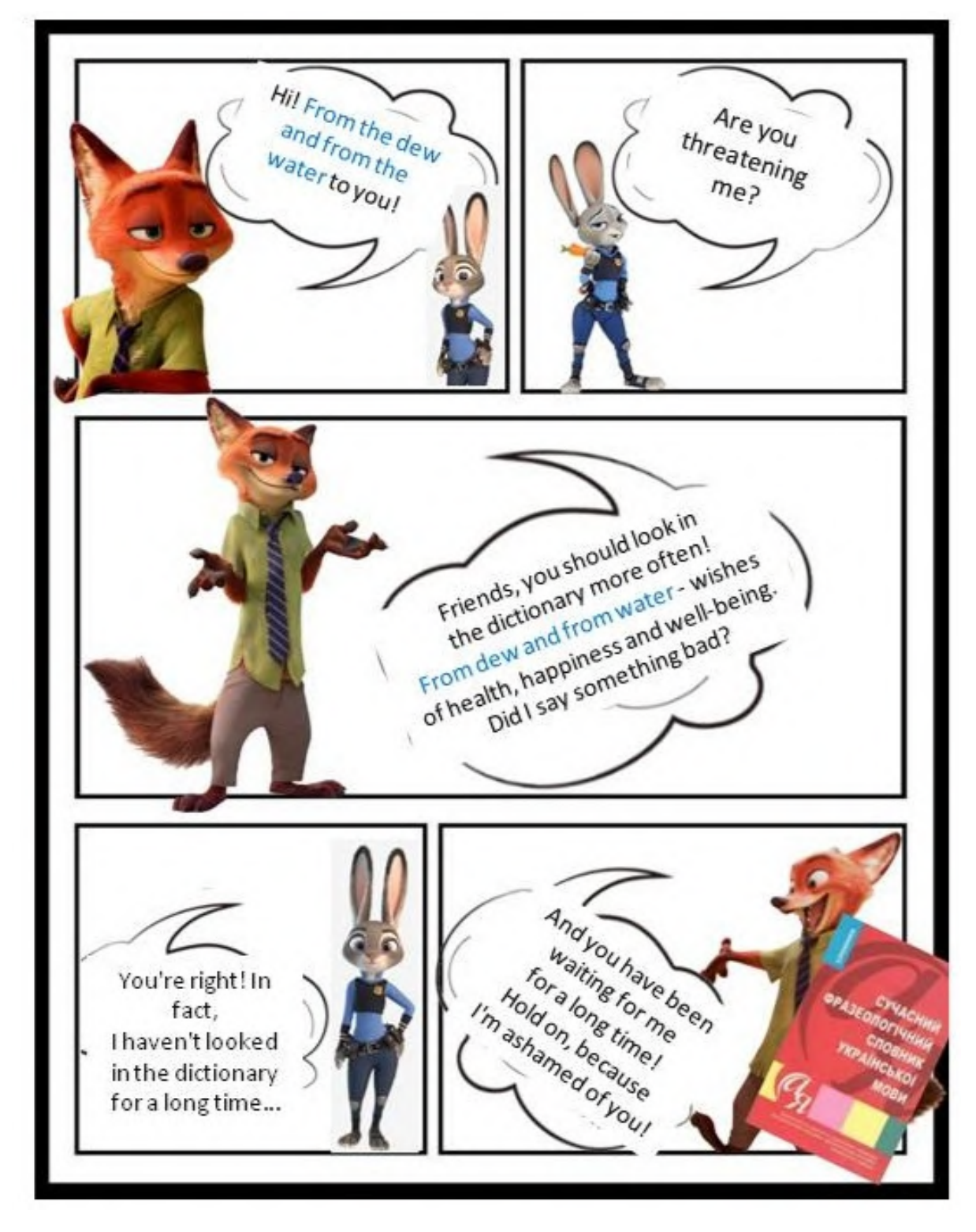
Figure 1: Example of a comic created using the Pixton online service.

The following program, which was chosen by us, is excellent for both individual and group work of junior school students. It is not required to register and fill out various forms here. There is an opportunity to create the simplest comic with ready-made templates.