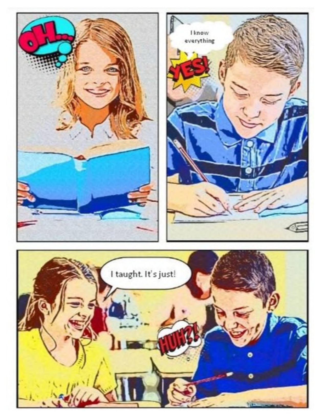
Figure 3: Comic Book Editor Comica.

As a result of the experiment, we found the willingness of teachers and students to use cloud services to create and use comics in educational practice. Appropriate criteria and levels of readiness have been identified and developed.