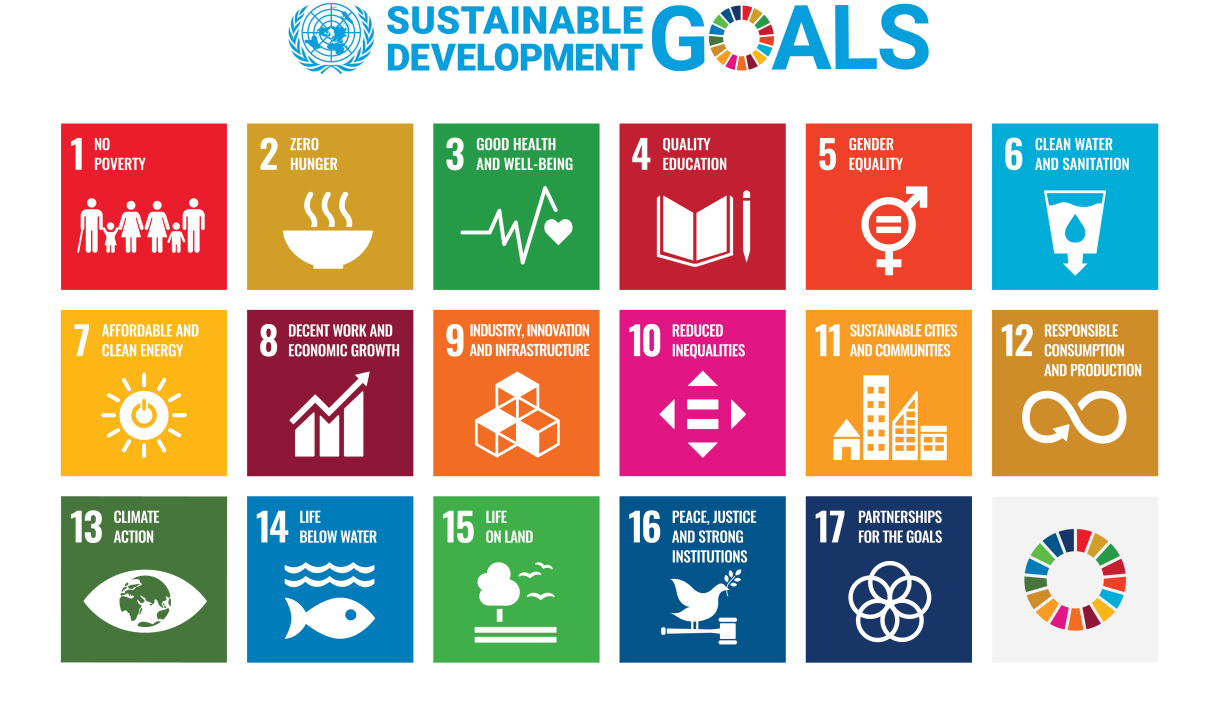
Figure 1: The United Nation's seventeen Sustainable Development Goals [1].

With the current state of quantum computers, the 6G requirement of trustworthiness is not seen as satisfied, making the achievement of the SDGs unmet. Indeed, the service provider may exhibit malicious behaviour compromising. A vulnerability arising from a lack of digital sovereignty.