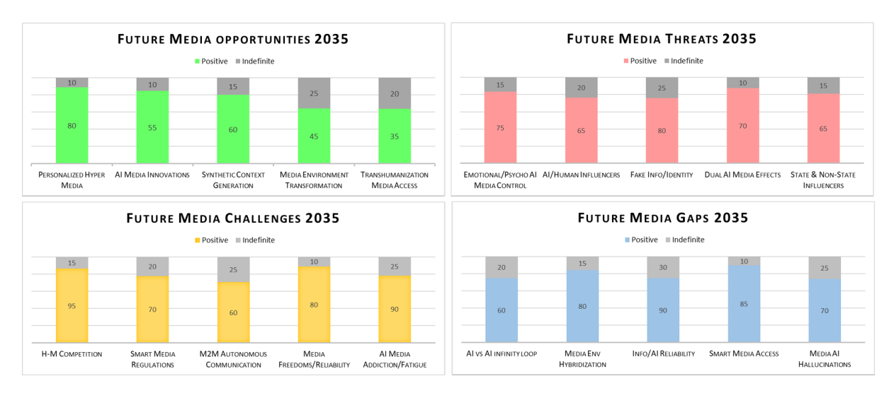
Figure 4: Future Media & AI aggregated verifications towards year 2035, after [14, 15].