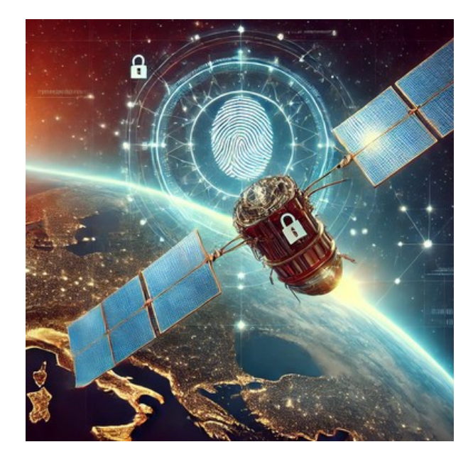
Figure 3: A visual representation of satellite and security [14].

The research also emphasizes the potential of multi-dimensional encryption by incorporating satellitespecific identifiers, such as radiation patterns, orbital positions, and ground station coordinates. These elements not only enhance security but also complicate attack vectors, ensuring robust protection against sophisticated threats.