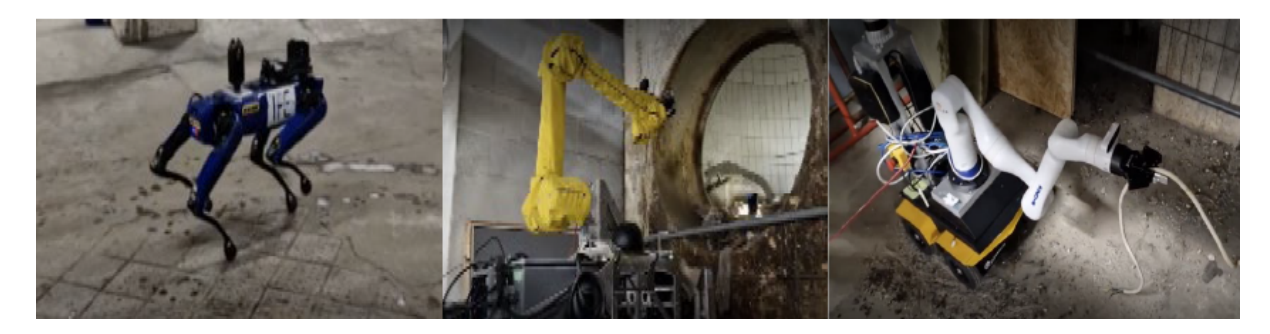
Figure 1: Deployment of the HADRON Laboratory Robotic Fleet in the RoboDecom project.

Robots such as Boston Dynamics' Spot , Clearpath's Jackal , and the nLink platform (see Figure 1 ) were deployed in realistic test scenarios to perform contamination mapping, swab sampling, material handling, and area scanning. The project demonstrated the feasibility of integrating semi-autonomous systems with digital twins for mission rehearsal, risk assessment, and operational planning, laying a technical and conceptual foundation for subsequent projects like DORADO and XS-ABILITY.