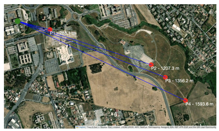
Figure 2: Map of the long-range ranging test. Measurements were taken from the rooftop of the Department of Information Engineering at the University of Rome Tor Vergata.

Figure 2 shows the test configuration: four test points (P1–P4) were selected at increasing distances from the transmitter, ranging from approximately 288 meters up to nearly 1.6 kilometers. The positions were manually surveyed on satellite imagery and chosen to represent realistic open-field deployment scenarios.