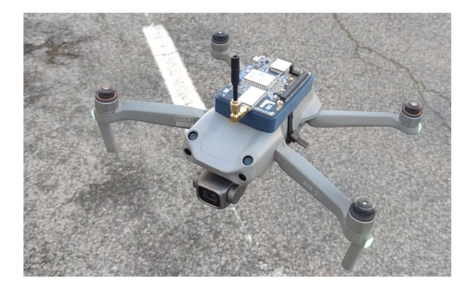
Figure 3: Test UAV equipped with the custom UWB/XBee board.

This setup demonstrates that the system is well-suited for experiments involving UAVs operating over large areas, and can serve as the basis for future tests involving dynamic mobile nodes and cooperative localization strategies.