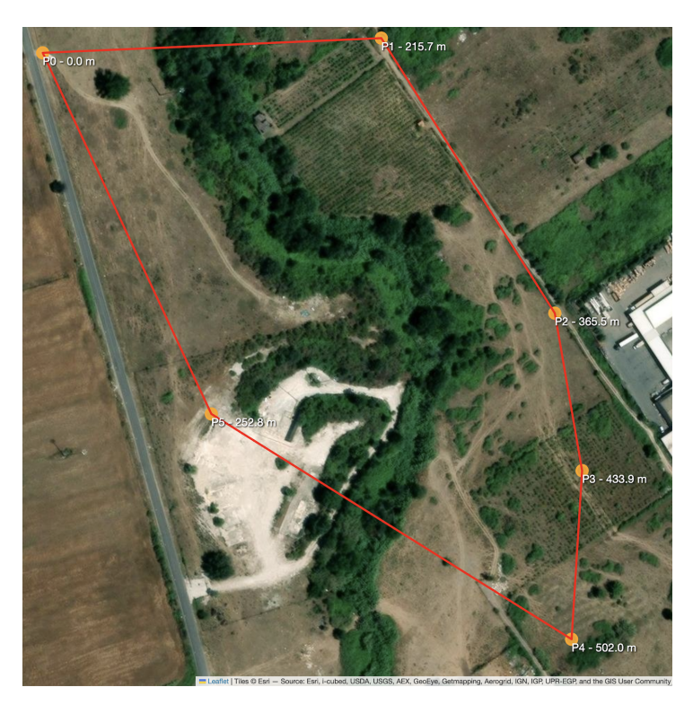
Figure 4: Flight path and measurement points for the airborne ranging experiment near CNR ARTOV.

The experiment was conducted in the open area in front of the CNR ARTOV (Area della Ricerca di Tor Vergata), a UAV-authorized test zone with a maximum flight ceiling of 45 meters. The UAV flew at a steady altitude of approximately 40 meters, following a predefined trajectory with intermediate hovering points for static data acquisition. The custom localization board developed in this work was mounted on a DJI Air 2S quadcopter, selected for its high stability, sufficient payload capacity, and autonomous flight capabilities. As shown in Figure 3, the board included the UWB transceiver, the ESP32 microcontroller (ESP32-WROOM), and the sub-GHz communication module (SX868), all housed within a compact 3D-printed protective enclosure. The antenna was positioned vertically to ensure optimal propagation and consistent line-of-sight (LOS) with the fixed ground node throughout the entire flight.