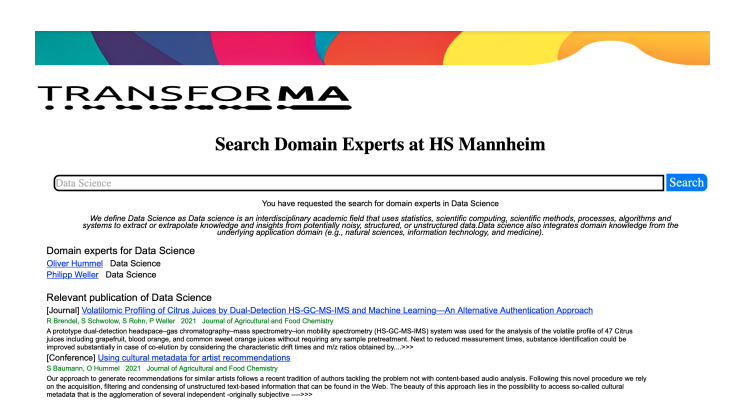
Figure 3: Exemplary Search Results with domain experts and relevant publications.

Architecture . We propose a proof of concept for our system based on a classic client-server architecture. The backend consists of a Flask application [16], which operates as a server and is