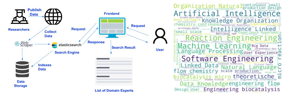
Figure 2: (a) Architecture diagram and data flow for search experience (b) Word cloud generated from the research areas of professors with Google Scholar profiles at Hochschule Mannheim

Gathering Professors . First, we parsed a list of professors from the university website. In total, it contained 188 professors that are listed together with some metadata like department, email, and telephone number.