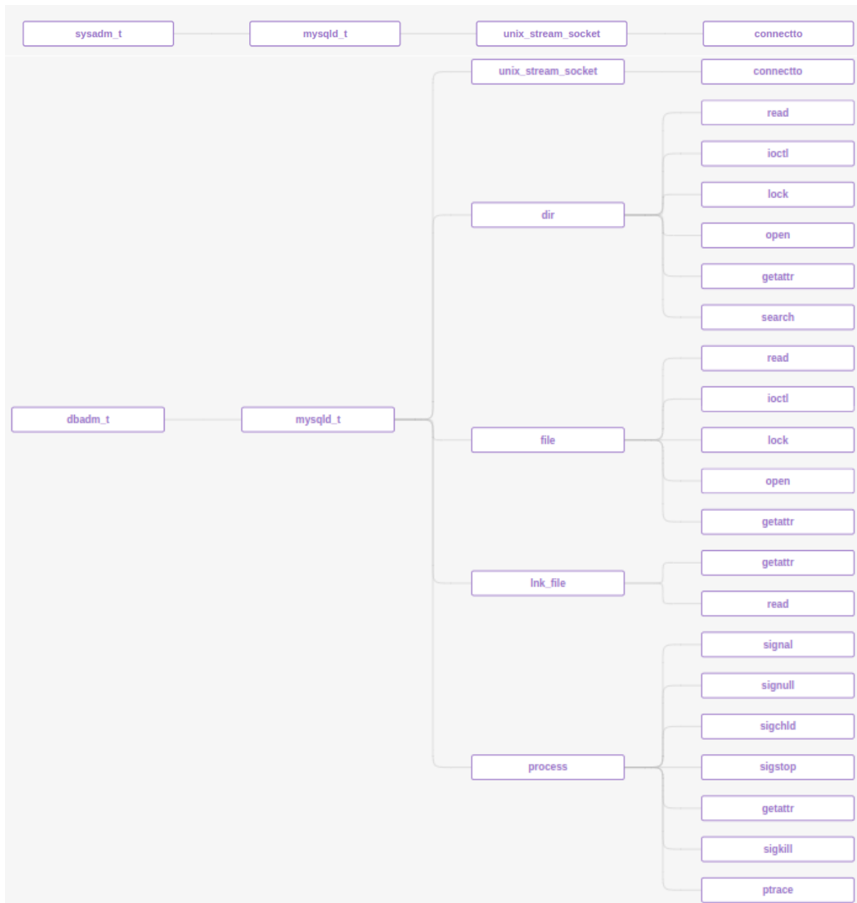
Figure 3: Tree view on the permissions of sysadm_t and dbadm_t on the object mysqld_t obtained with ApexTree and ASP Chef

allow dbadm_t mysqld_t:dir read; allow dbadm_t mysqld_t:dir ioctl; allow dbadm_t mysqld_t:dir lock; allow dbadm_t mysqld_t:dir open; allow dbadm_t mysqld_t:dir getattr; allow dbadm_t mysqld_t:dir search; allow dbadm_t mysqld_t:file read; allow dbadm_t mysqld_t:file ioctl; allow dbadm_t mysqld_t:file lock; allow dbadm_t mysqld_t:file open; allow dbadm_t mysqld_t:file getattr; allow dbadm_t mysqld_t:lnk_file getattr; allow dbadm_t mysqld_t:lnk_file read; allow dbadm_t mysqld_t:process signal;