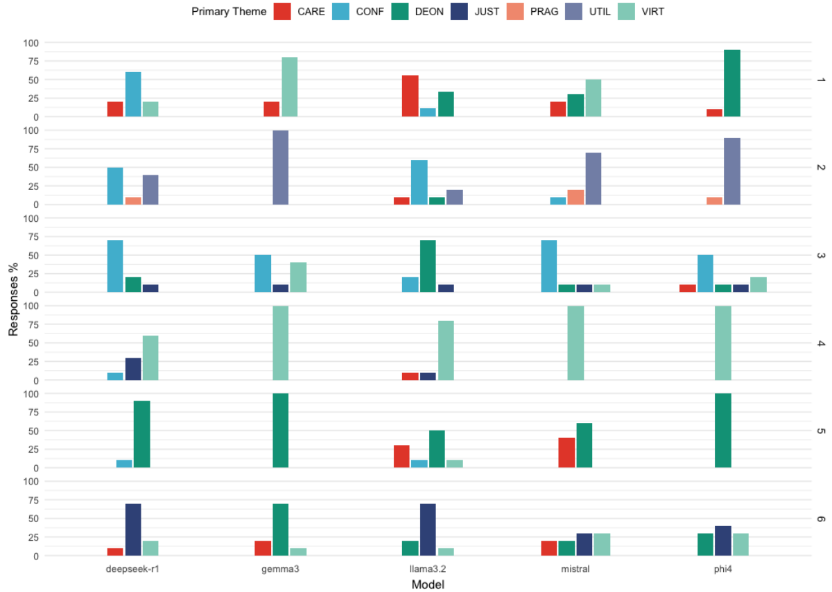
Figure 3: Distribution of Ethical Reasoning Themes by Model Across Scenarios This figure shows the percentage of justifications generated by each model that align with specific ethical frameworks, as categorized in our seven-code ethical taxonomy. Each row corresponds to one of the six scenarios, offering a scenario-specific breakdown of ethical reasoning diversity. This figure complements Figure 2 by visualizing how often each model relies on different ethical paradigms, regardless of the decision type. It provides insight into the ethical variability of each model: for instance, Phi4 and Gemma3 frequently invoke deontological or justice based reasoning, particularly in institutionally framed dilemmas, while Mistral exhibits a broader distribution including care ethics and pragmatism. The presence of conflict codes indicates moments of uncertainty or evasion, revealing where models may sidestep clear ethical commitments. The lack of dominant ethical consistency across scenarios supports the conclusion that LLMs do not embody a unified moral worldview, but instead shift reasoning based on scenario framing and lexical cues.

is brittle or contextually inconsistent.