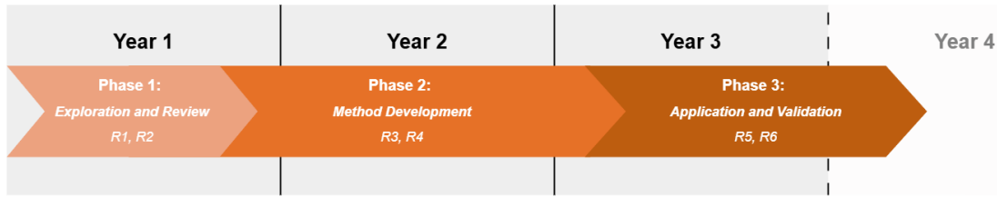
Figure 2: The structure of my PhD research is divided into three phases. The initial phase, lasting approximately 9 months, focuses on exploring and reviewing existing methods to address research questions R1 and R2. The second phase, spanning about 15 months, is dedicated to developing novel methods to explain uncertainties, addressing research questions R3 and R4. The final phase, expected to take around 12 months, involves the validation and application of the developed methods, answering research questions R5 and R6.