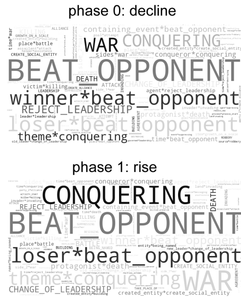
Figure 3: Wordclouds of Event tags in the binary classification task. The wordclouds include only the examples where all annotations agreed on the same label. Event frames are represented in uppercase while frame elements in lowercase.

on the same label. Figure 3 reports the wordclouds for the binary classification task. As introduced in Section 2, Event Frames are shown in uppercase, while Frame Elements in small caps, along with their Frame, in the format FRAME_ELEMENT*EVENT_FRAME . The larger and bolder a word, the more strongly it is associated with that particular phase. From the wordclouds is clear that there are overlapping Event Frames between the two phases (eg: CONQUERING, WAR, CHANGE_OF_LEADERSHIP, BEAT_OPONENT), while the same Frame Elements seem to have different frequencies in the two phases.