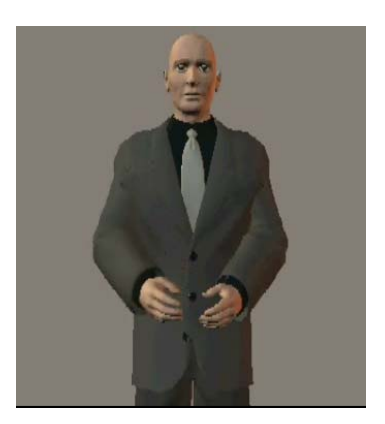
Figure 1 Example of signing avatar

Typically, airport information announcements, such as gate changes and delays, are announced over a PA system and often such information does not appear on screens for some time if at all. This causes considerable hindrance to D/deaf and HOH people who may be left uninformed and possibly inconvenienced through no fault of their own. To help alleviate this, we chose to orient our MT system specifically toward this domain. In an airport scenario, should there be alterations to flight information, the relevant piece of information could be typed into the MT system, which would automatically translate the sentence into ISL. The information would then be signed in real ISL by a mannequin on video screens for people to view. An example of the generated mannequin that would sign the output is in Figure 1 taken from Poser 4 ProPack Software<sup>4</sup>.