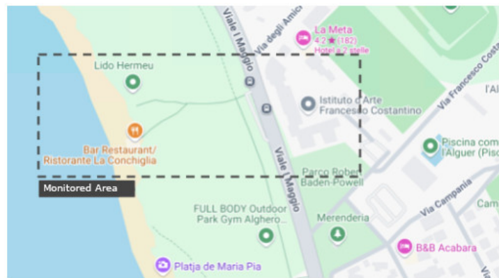
Figure 2: Excerpt of the Alghero map with the selected area highlighted for the use case.

The pilot site for SKET-MONITOR is a critical segment of Maria Pia beach in Alghero, Sardinia—an ecologically sensitive coastal area subject to intense seasonal tourism. Characterised by delicate ecosystems such as sand dunes and a pinewood forest, as well as narrow access points and limited infrastructure, the site suffers from severe overcrowding, increased vehicle emissions, and mobility bottlenecks during the high season. The selected portion of the territory, highlighted in Figure 2, was chosen for its representativeness of the challenges facing coastal municipalities in managing environmental sustainability and tourist pressure. This area serves as the focus of the pilot implementation, allowing the system to capture and simulate critical dynamics through real-world data. These pressures place significant strain on both the environment and local services, underscoring the need for proactive, data-driven territorial management.