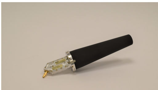
Figure 1: S-band TTC Antennas from Beyond Gravity

The second selected study case aimed to involve both metallic materials and polymers, leading to the choice of thermal blankets (Figure 2), despite potential challenges in their in-orbit manufacture. Thermal blankets are crucial elements in a space system, ensuring the survival of spacecraft internal instrumentation under the demanding thermal loads of the space environment. Initiating a preliminary study for repairing such a component is fundamental for the extension of the operational life of a space system. The material and design of thermal blankets can vary based on the supplier, application, and needs. Partners are expected to choose the best solution in terms of materials, manufacturing processes, and required power. The goal is to understand the type and quantity of materials that can be reused starting from a 1m x 1m thermal blanket and determine the feasibility of manufacturing it in orbit.