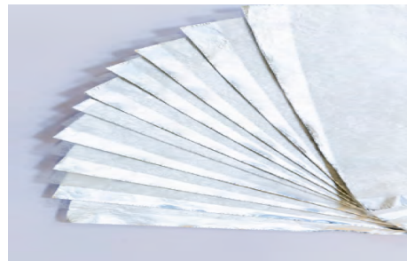
Figure 2: COOLCAT 2 NF from Beyond Gravity