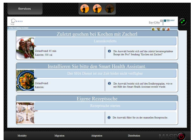
Figure 3: Screenshot of our implementation of the meta-UI.

These configuration options allow adapting the interactive space according to the possible changes defined e.g. by Coutaz [6]. The user can redistribute the UI elements to different interaction resources (at the interactor level) by moving or cloning elements, migrate parts or the complete user interface to another IR and can also remould the existing user interface on one IR by adding or removing UI elements.