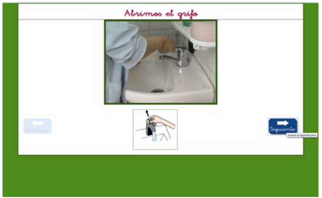
Figure 1. The "how to wash your hands, step by step" lesson

The first experience supports the ADL of washing-up the hands. A touch screen hanged on the bathroom wall displays the sequence of steps to follow the activity.