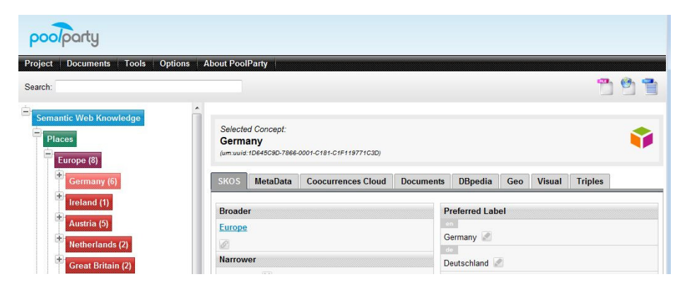
Fig. 1 PoolParty's main GUI with concept tree and SKOS view of selected concept

The main thesaurus management GUI of PoolParty (see Fig. 1) is entirely web-based and utilizes AJAX to e.g. enable the quick merging of two concepts either via drag & drop or autocompletion of concept labels by the user. An overview over the thesaurus can be gained with a tree or a graph view of the concepts.