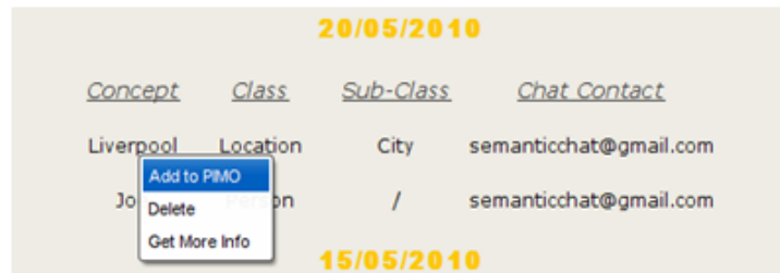
Fig. 2. A context menu showing the three options presented for each concept

passed directly through ANNIE to extract any existing events. Since by default ANNIE does not handle such entities it had to be extended. This was done by implementing a number of JAPE rules that specify how to recognize possible events within a chat conversation using regular expressions in annotations, as can be typically seen in Figure 3.