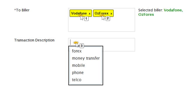
Fig. 6. Tag recommendation (suggestion)

Scenario 4: Tag recommendation for multiple bill payment (mobile and money transfer). User clicks on "Vodafone" (1) and then "OzForex" (2) biller tags, and clicks to enter a description tag (3). As a result, a set of related tags are recommended that are used in the context of the selected billers.