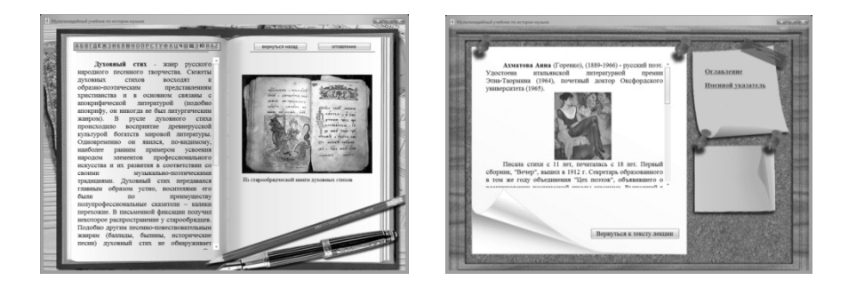
Fig. 3. Pages from Glossary (Spiritual Verse), and Index (Anna Akhmatova).

Texts of lectures, modules and clusters were composed with the reference to modern printed books on the history of Russian music (I. Rapatsky History of Russian Music: From Ancient Rus' to the Silver Age , Moscow (2001) (In Russian). In addition we used other books (E. Orlova Lectures on the History of Russian Music, Moscow (1979) (In Russian); B. Asafiev Russian Music of 19<sup>th</sup> and 20<sup>th</sup> Centuries, Leningrad (1978) (In Russian); T. Levaya Russian Musical Culture of the Early 20<sup>th</sup> Century in the Context of Artistic Trends of the Era, Moscow (1991) (In Russian)), as well as multi-volume history of Russian Music edited by A. Kandinsky, and Y. Keldysh, Internet sources (such sites as mus-info.ru,classic-music.ru,belcanto.ru, etc.). Glossary that includes 262 items and Index of names including 335 items have interesting selection of concepts from theory of music, music history and general cultural context. Informative sections of the book are supplemented with the biographies of 25 Russian composers, and 11 of the most famous opera librettos.