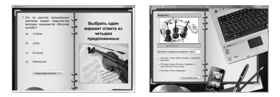
Fig. 5. Musical Quiz and Test.

Passing each stage of the quiz, students can examine the record of their answers, compare them with the right options and find out the level of their knowledge. In addition, the textbook contains an actual test at the end of each unit, students are offered two variants of closed test, so they have to choose one ore more correct answers.