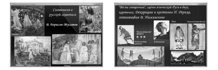
Fig. 4. Pages of slide show.

Special attention is given to the system of means aimed at controlling students' knowledge of theory and musical compositions. Traditionally while studying the course of history of music, students are supposed to penetrate the world of music through listening to numerous pieces of music. The multimedia textbook provides students with an opportunity to listen to the set of compositions , and use quizzes to test their knowledge: