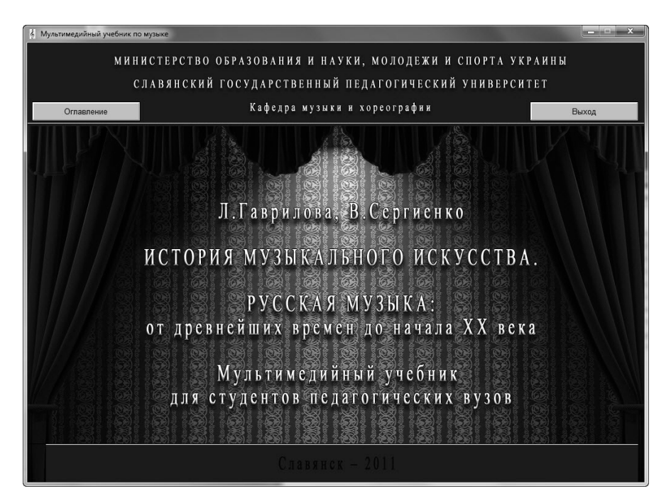
Fig. 1. The cover of the textbook.

Ancient Times to the Early 20<sup>th</sup> Century was created as the basic studybook for the course History of Russian Music , obligatory for the students of Slavyansk state Pedagogical University (specialty 6.010102 – Primary Education, specialization: Music). The textbook can be used not only in the system of art education in pedagogical universities, but also in professional music education, since similar courses are offered in music schools and conservatories.