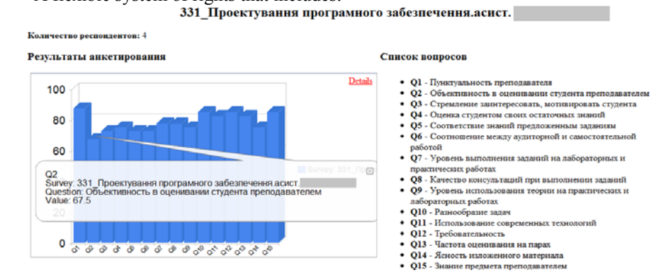
Fig.1. Example of voting results presented by chart.

A flexible system of rights that includes: