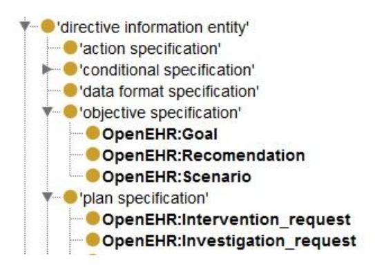
Fig. 3. The OpenEHR entry directive information branch Using this new ontology, we proceeded to analyse one archetype of each main branch (observation, action, evaluation and instruction) contained in the OpenEHR Clinical Knowledge Manager (OpenEHR Foundation, 2010). Our criteria for selection were based on published status and frequency in medical records. The findings are summarized in the next section.