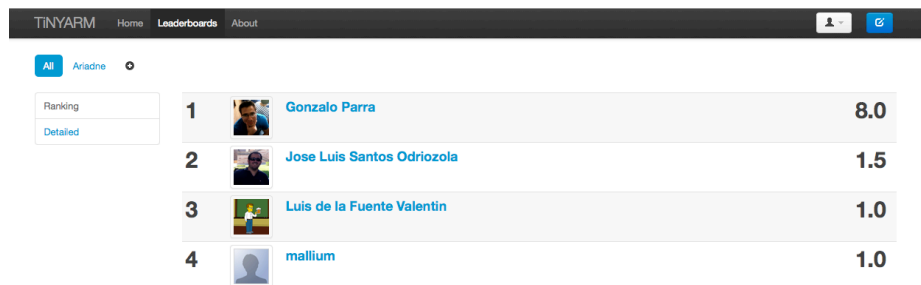
Fig. 2. TiNYARM’s general leaderboard.

Through the use of leaderboards, TiNYARM tries to encourage competition between researchers in a light and ‘fun’ way. User rank is determined by activities as reflected in the number of “read”, “to read”, “skimmed” or “suggested to others” papers. The application has a global leaderboard based on a score that is calculated from the activities of the last month – see Figure 2. To obtain this score, the different actions are weighted. While designing the application, this rating system was evaluated via feedback from test users.