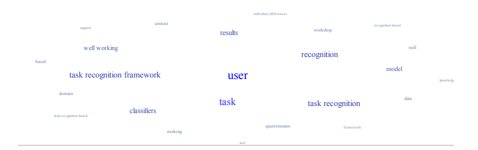
Fig. 1. Example of a tag cloud as it was shown to the user.

scores in each of the three lists relative to the maximum and minimum scores. We then calculated for each term the average of the three normalized scores. We ordered the terms by the combined scores and extracted the top-150. These terms were judged in alphabetical order by the owners of the document collections. We asked them to indicate which of the terms are relevant for their work. There was a large deviation in how many terms were judged as relevant by the users (between 24% and 51%), but on average, around one third of the generated terms (36%) was perceived as relevant.